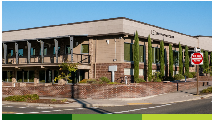
Umpqua Business Center, 522 SE Washington Ave., Roseburg