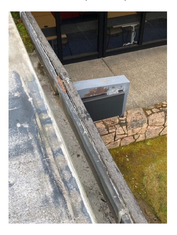
6. Gutter above South side (over offices) above flat roof.